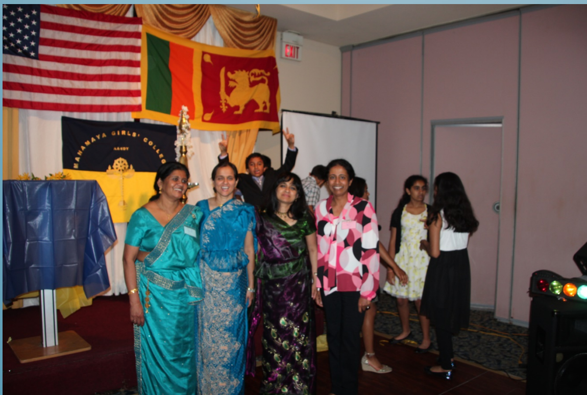
Children making friends with each other in the background.