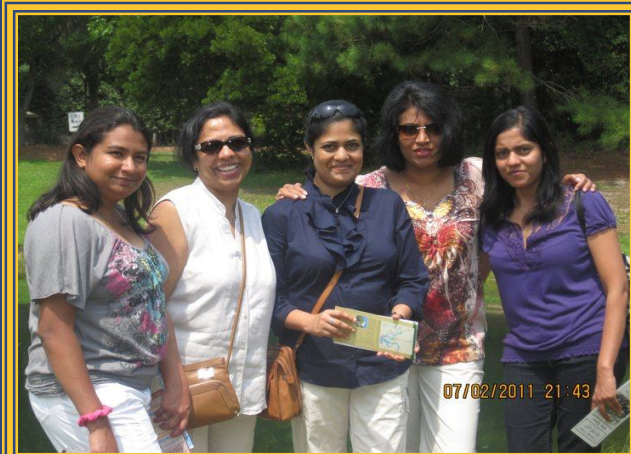
places Site-seeing group: Visiting slave farms, the city's historic

Dear Members, Please note that more photographs of the AGM can be found on our Yahoo Group page “Mahamayafriends”