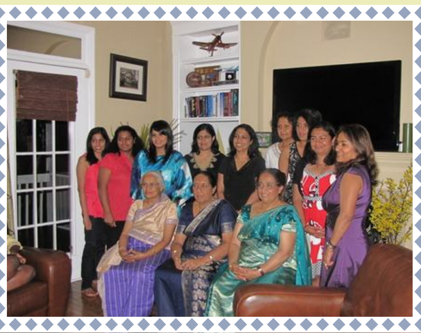
All of us Mayans at the dinner