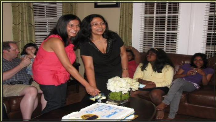
The incoming and outgoing presidents cutting the cake