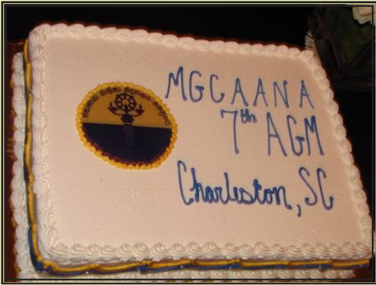
The beautiful cake to celebrate MGCAANA's 7th successful year