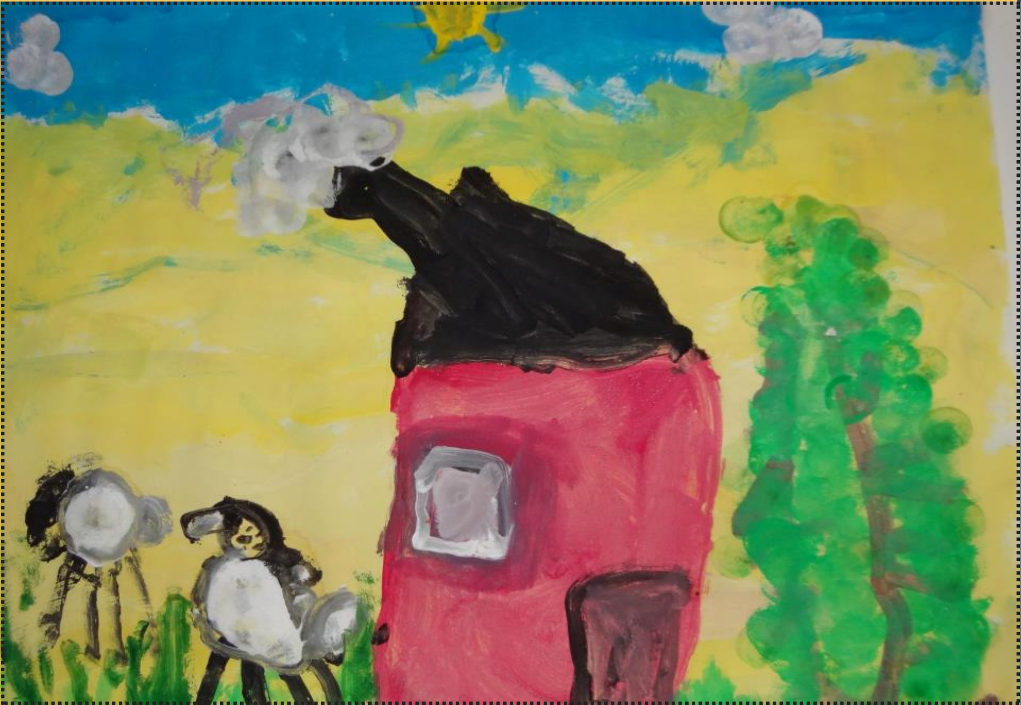
Drawing By Ravindu Karunaratne