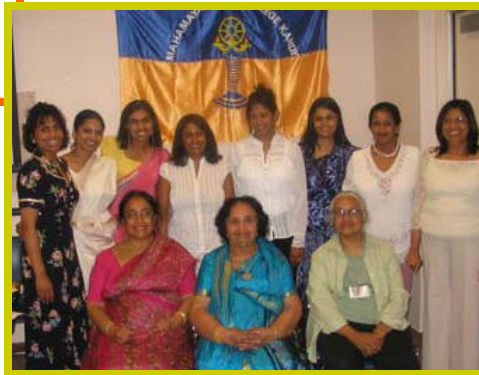
All the members who attended the 3 rd annual general meeting in Las Vegas